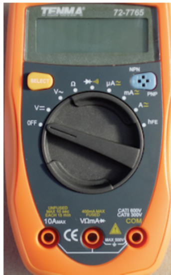
Figure 1: A typical multimeter

A multimeter can be used as an ammeter to measure current, as a voltmeter to measure potential difference, and as an ohmmeter to measure resistance. It can measure both AC and DC currents and voltages. To avoid damaging the multimeter and other components in a circuit, it is critical to use the correct setting for the kind of measurement you will be making.